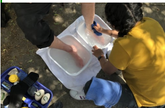
Foot Clinic in Action