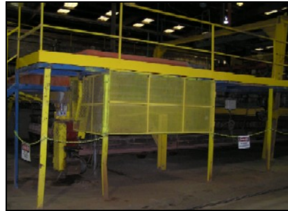
View of stacker shows barricaded undercarriage where incident occurred.

On May 5, 2005, a 55-year-old experienced millwright maintenance mechanic was killed while inspecting repairs to a building materials setting machine. New parts had been installed a week earlier. The repaired machine, commonly called a “stacker,” had been operating well for 4 days prior to the incident. On the morning of the incident, the stacker was in operation for 1 hour, and then put into idle mode for a few minutes while the operator added more unfired product by hand. While the stacker was idling, the mechanic entered a barricaded, posted area under the stacker to inspect the stacker’s alignment chain. The mechanic failed to lockout the machine and did not notify the operator. The mechanic was apparently leaning over a support beam to inspect the chain alignment when the operator took the machine out of idle and resumed operation. The stacker’s traveling bar, located under the deck, evidently crushed the mechanic’s head against the support beam. The victim was discovered within minutes by the plant manager. Local law enforcement and medical crews arrived shortly thereafter, and the victim was declared dead at the scene.