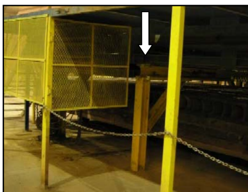
Arrow shows the horizontal crossbeam under the stacker, inside the barricaded area.