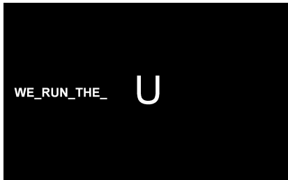
Fig. 1. RSVP keyboard interface

ERP-based Hexo-Spell uses an RSVP like presentation at the central area, while options (sets of symbols) are displayed around it [3]. RSVP is particularly useful for most users with weak or no gaze control and for those whose cognitive skills do not allow processing matrix presentation of letters. An example screen snapshot from the current RSVP Keyboard prototype is given in Fig. 1. The optimal layout of the screen is a point of research in itself and we will not discuss that issue in detail here.