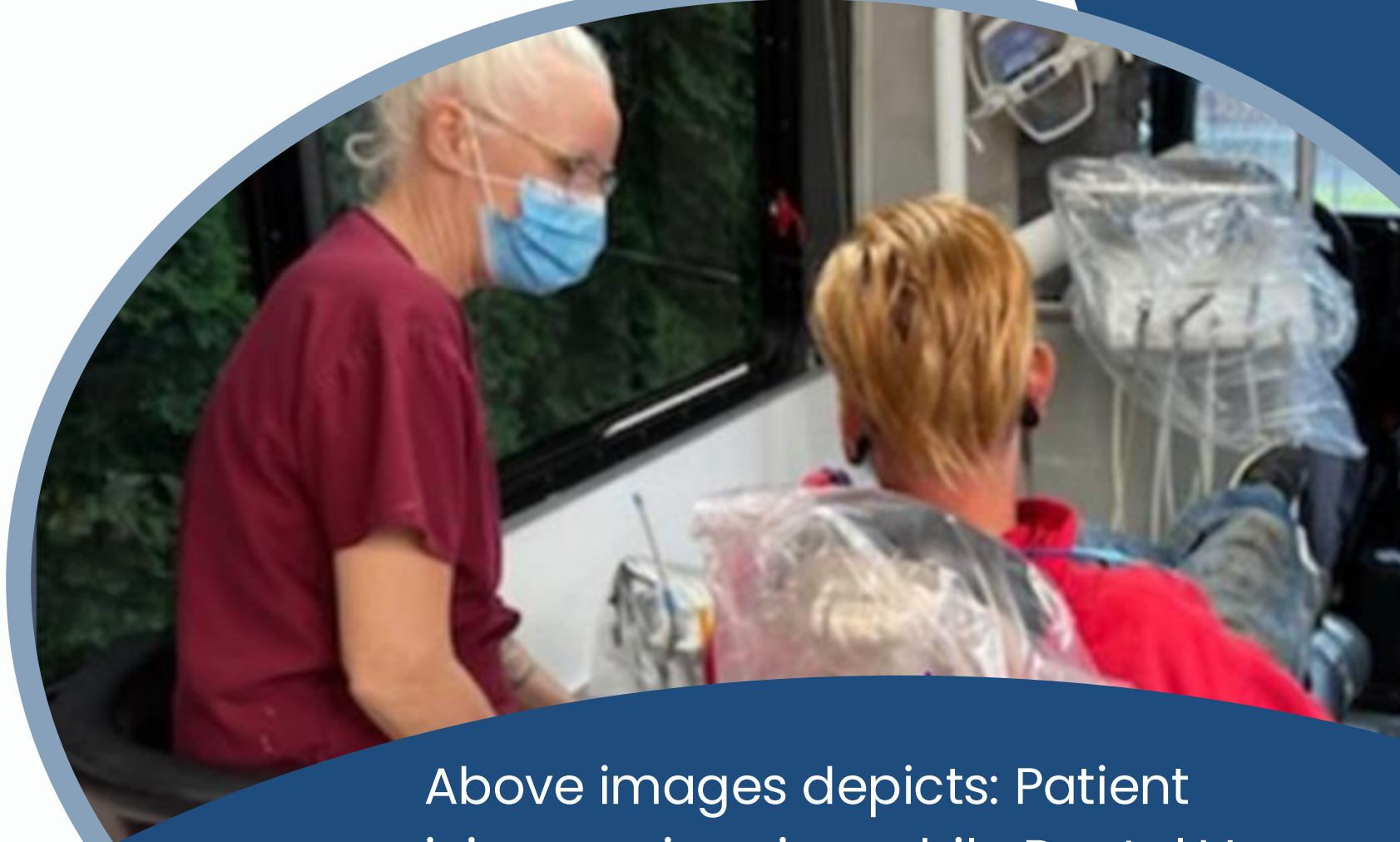
Above images depicts: Patient receiving services in mobile Dental Van unit. First dental visit!