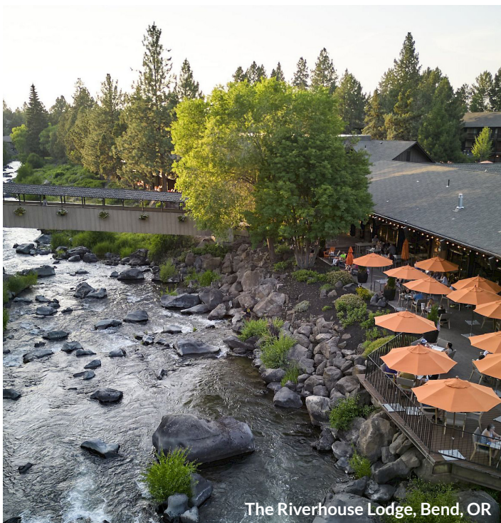
The Riverhouse Lodge, Bend, OR