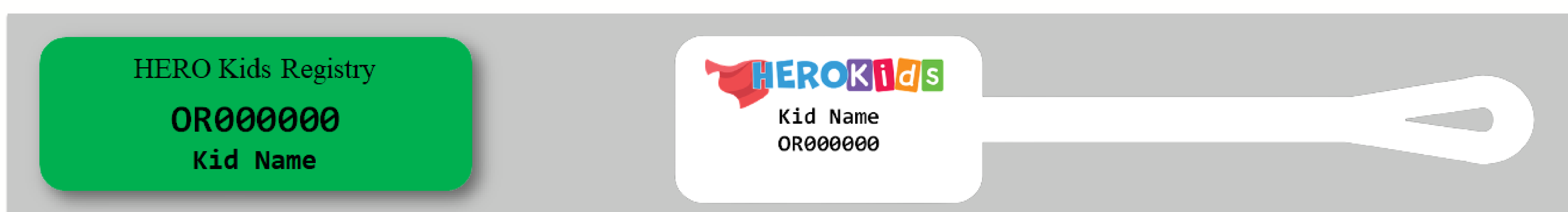
HERO Kids registry ID sticker

HERO Kids Registry bridges the information gap by giving emergency medical providers information about special health considerations as well as multiple emergency contacts.