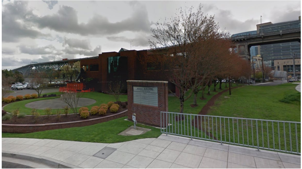
3030 SW Moody Building – gathering place for On Campus Emergencies

If an emergency should occur while you are in the Robertson Collaborative Life Sciences Building (RLSB) PA Program classroom, 1S040, the Program has established the parking lot of the 3030 S Moody building as the meeting point to gather and assess the situation. If the 3030 building is inaccessible due to TriMet issues or a problem on the Tilikum Crossing, students will gather at the Schnitzer lot to the north of the RLSB. For all OHSU locations other than our classroom, please follow the instructions of onsite personnel.