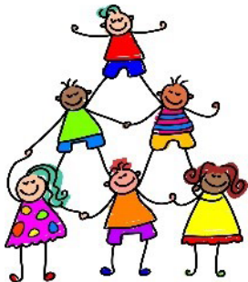
A support person