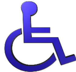
Wheelchair accessible room