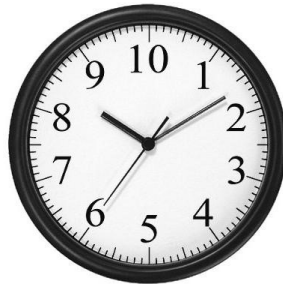
Extra time for your appointment