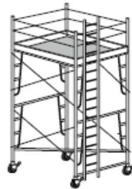
Example of a mobile scaffold with guardrail and mounting ladder (Source: OR-OSHA, 2005, Scaffolds: Temporary elevated work platforms ).

Guardrails and toe guards on scaffolds are only required at heights 10 feet or more above the ground. This incident demonstrates that falls from less than 10 feet can still cause serious, even fatal injuries. Employers may want to consider the use of guardrails at lower heights to reduce risk for workers.