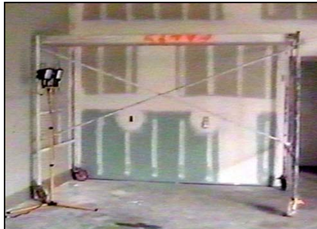
The scaffold used by the drywall installer and his lead man in this incident had only a single plank on the deck.

The installer was holding the sheetrock against the wall when the scaffold suddenly moved backward, causing him to lose his balance and fall. He hit his head on the concrete floor. The victim was transported to a hospital, where he died 2 days later.