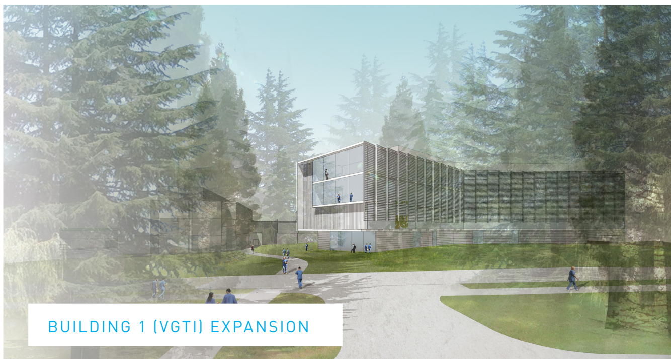
BUILDING 1 (VGTI) EXPANSION