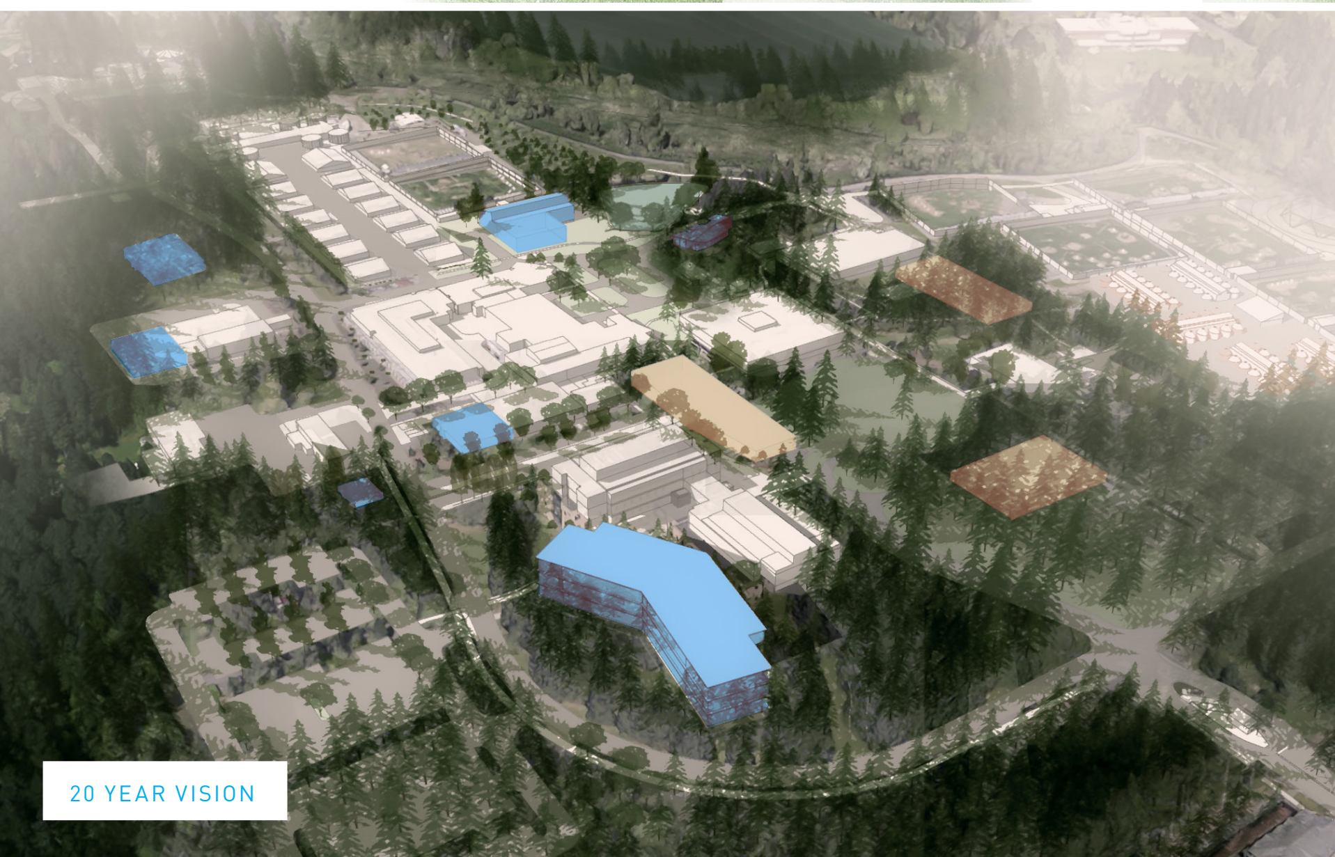
20 YEAR VISION