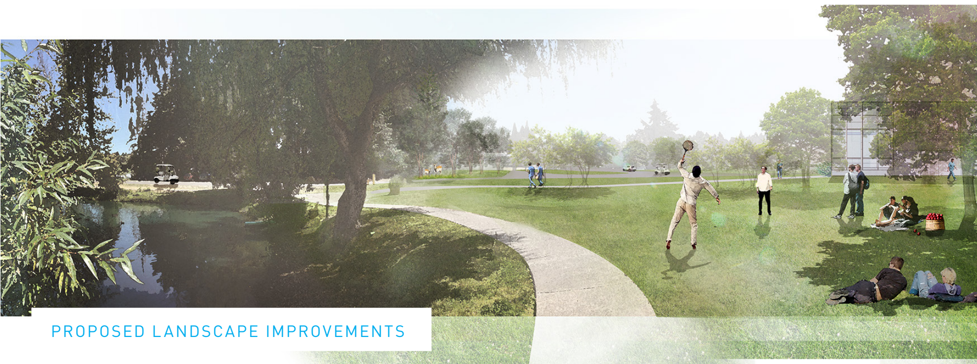
PROPOSED LANDSCAPE IMPROVEMENTS