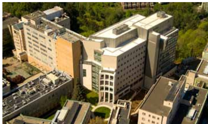
Academic & Research