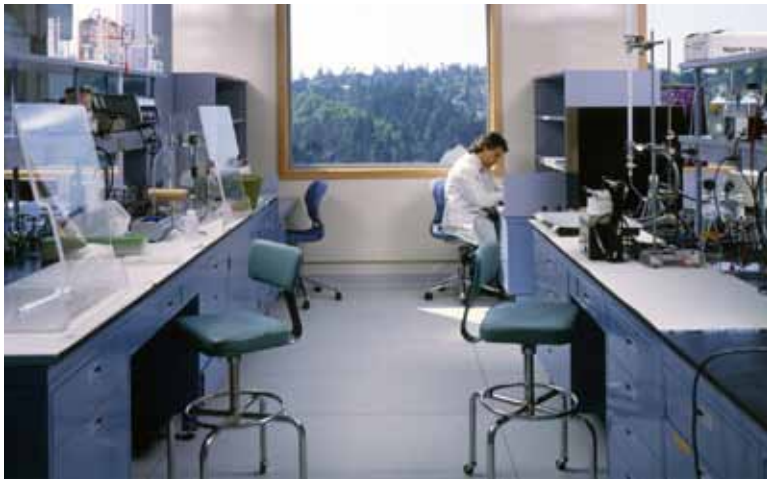
OHSU Vollum Flexible Lab Space

The overall movement within the institution toward a more collaborative, interdisciplinary, service-lines-based mode of operation presents the largest issue for the distribution of research spaces on the campus. Adjacency and overlap with clinical care and with teaching forums should be planned to promote interaction and collaboration. Certain large additions to the institution, such as a Clinical Trials program or Cancer Institute, will present clear and obvious opportunities for promoting an overlap of research with other activities. In other cases, the opportunistic nature of research facility expansion may bypass consideration of collocations that would foster collaboration.