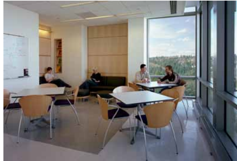
OHSU BRB Interaction Space

Parking – Many focus groups report that there are insufficient parking options on Marquam Hill.