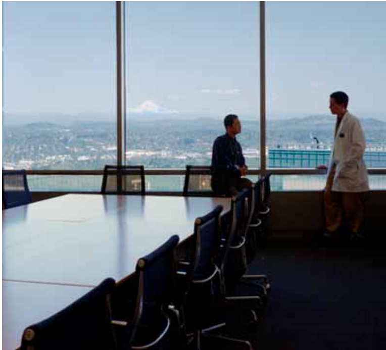
OHSU BRB Conference Room

Support Space – Lack of storage is a significant problem noted by all clinical departments and nursing staff. Nursing floors and Clinical Laboratories report insufficient support space. There is also a campus-wide shortage of conference and meeting rooms.