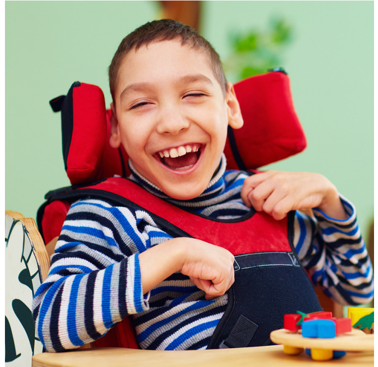
One in five Oregon children has a special health need.

OCCYSHN is housed at Oregon's only academic medical center, Oregon Health & Science University. This setting lends the benefits of research, education, and clinical expertise to OCCYSHN's public health work.