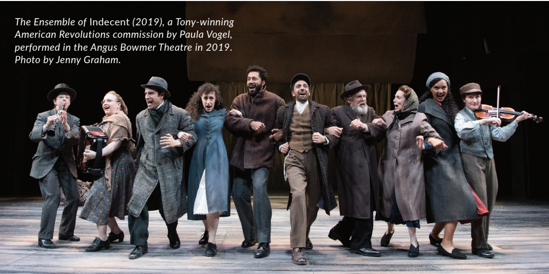
The Ensemble of Indecent (2019), a Tony-winning American Revolutions commission by Paula Vogel, performed in the Angus Bowmer Theatre in 2019.

AMA Credit: OHSU School of Medicine designates this live activity for a maximum 12.75 AMA PRA Category 1 Credits™. Physicians should claim only the credit commensurate with the extent of their participation in the activity.