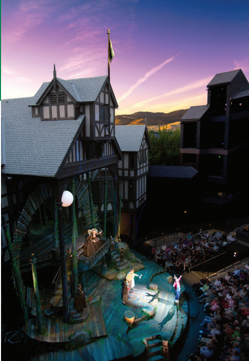
The Oregon Shakespeare Festival's Allen Elizabethan Theatre. Featured is the set of OSF's 2013 production of A Midsummer Night's Dream.

Executive Director for Research, Providence Health Care Professor of Medicine, University of Washington Co-Principal Investigator, Institute of Translational Health Sciences