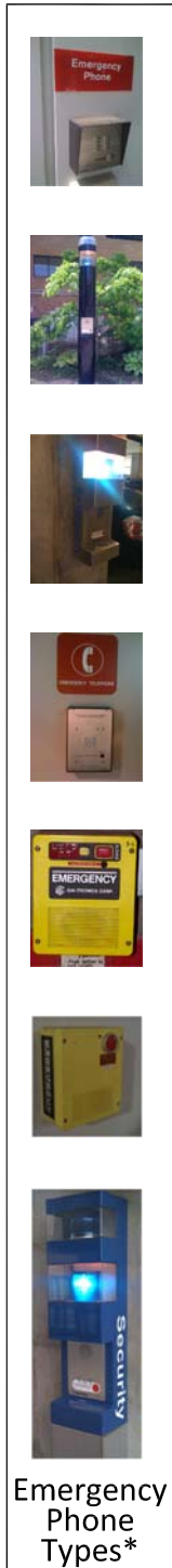
Emergency Phone Types*