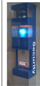
Emergency Phone Types*

KCRB - 01 Terrace KCRB - P1/P2 West KCRB - P1 Entry Door