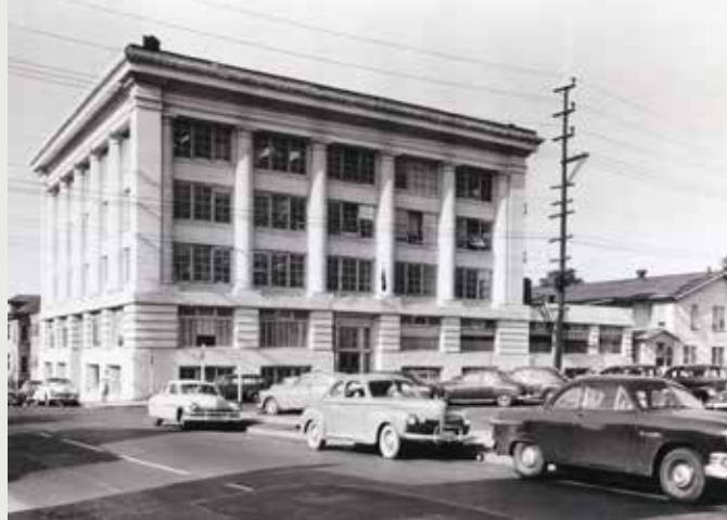
Between 1911 and 1955, the dental school was located on northeast Sixth Avenue between Oregon and Pacific streets.

Students applying to dental school in 1924 were required to have four years of high school and one year of college. 66