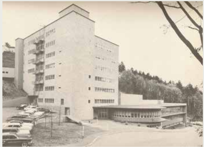
This photo of the 1956 Marquam Hill dental school building appeared in the 1959 Impressions .

“When the legislature closed its doors and the smoke blew away, the Dental School had been accorded a budget of $525,281 for the 1949-1951 biennium, which we feel is an expression of confidence not only on the part of the University, the State