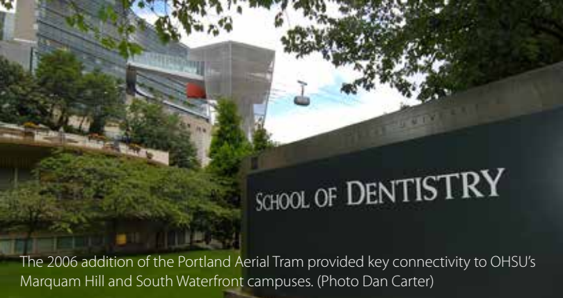
The 2006 addition of the Portland Aerial Tram provided key connectivity to OHSU's Marquam Hill and South Waterfront campuses.