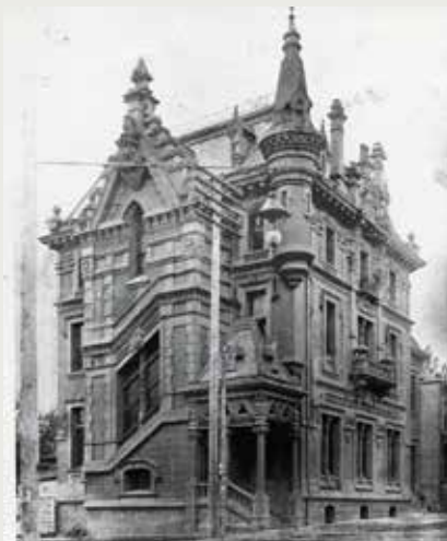
The first dental school building was located at NW 15th and Couch.

Both dental schools officially began educating dental students and caring for patients in October of 1899. 3