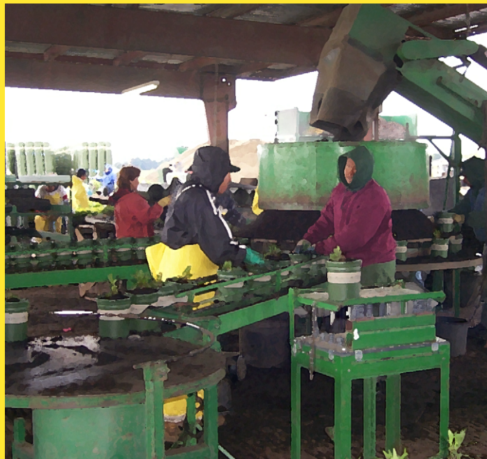
Replanting nursery stock