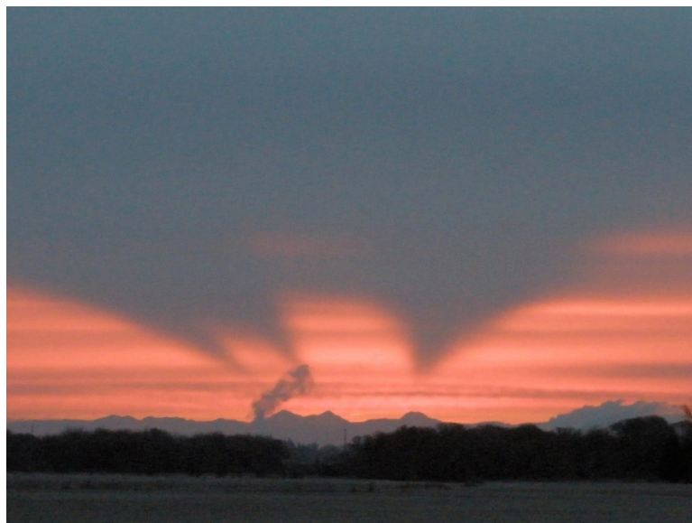
Winter sunrise over the Willamette Valley. The shadow of the Three Sisters is reflected off the bottoms of the clouds.