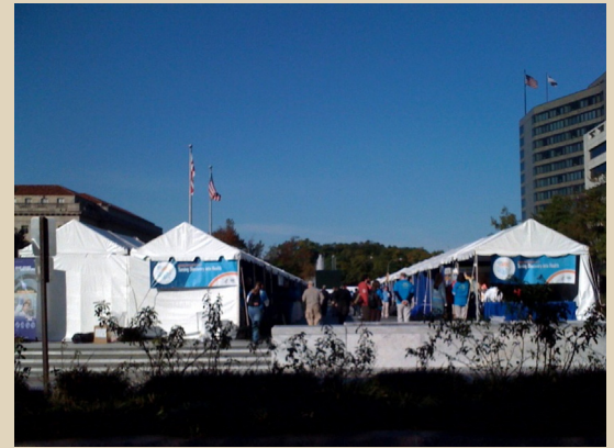
Let’s Get Healthy’s exhibit at Freedom Plaza for the USA Science & Engineering Festival.

As the title suggests, the focus of the entire exhibit is healthy living. Participants of any age received immediate feedback about the quality of their sleep and lifestyle by completing a computer-based survey. They also had body measurements taken. Each of these health screens was completely voluntary and no