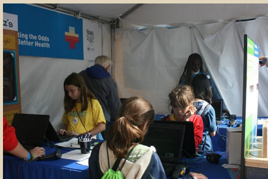
Visitors at the sleep and lifestyle survey station.

The interactive exhibit invites attendees to enroll as research participants where they can learn about the quality of their lifestyle, sleep, body composition and other areas of healthy living. Let’s Get Healthy! is partnering with West Virginia University for the event and will also feature travelling exhibits related to nutrition developed in