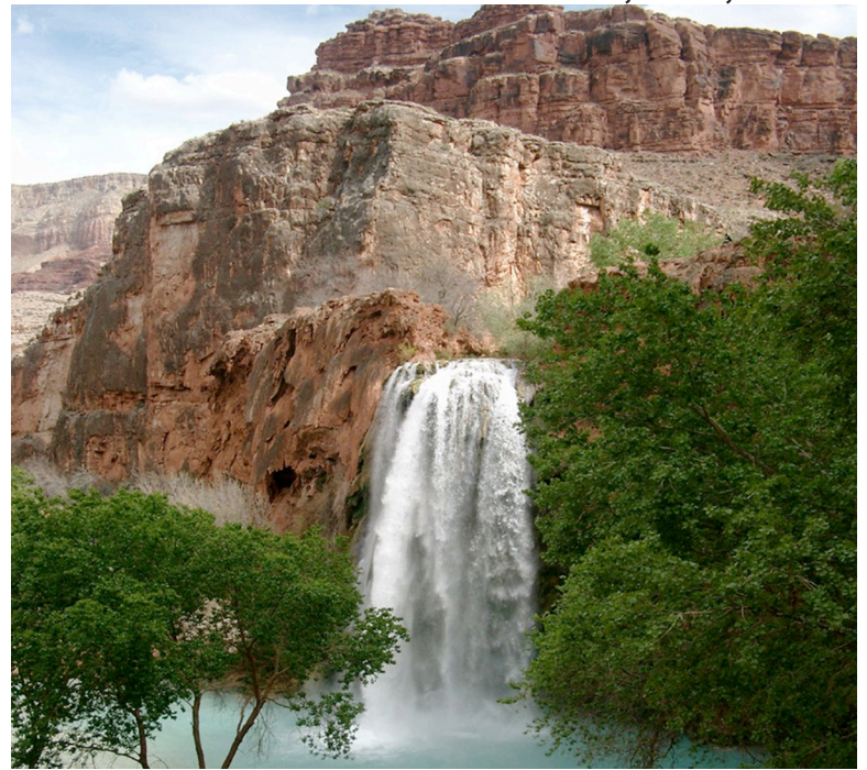
see page 6 for description.