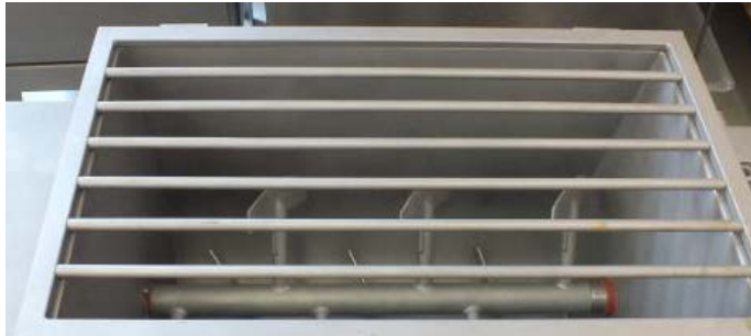
Figure 5. Example of guard for blender/grinder to prevent access to moving parts but allow cleaning.

Recommendation # 2: Host employers should establish routine procedures for communicating and reviewing hazards in their work environment and control methods with contractors.