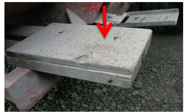
Figure 2. Close-up of wooden platform constructed by employer.

The worker was standing on the make-shift platform on the moving trailer when his baseball cap flew off. He stepped off the platform to retrieve his cap. Once retrieved, it is not known whether he stepped onto the platform and then lost his footing, or if he fell while attempting to step onto the platform. In the fall he struck his head on a large rock on the edge of the