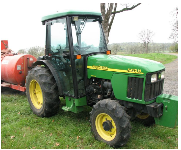
Figure 1. Tractor and trailer mounted 400 gallon chemical tank.

It was the end of the day, workers were returning to the equipment shop after applying pesticide in the vineyard. On the crew was a 41year old worker who had worked for the employer for five years. Witnesses reported that he was standing on a make-shift wooden platform that had been attached to a trailer mounted 400 gallon chemical tank containing pesticide. The make-shift wooden platforms were created and installed by the employer. The trailer was in tow by a tractor. The worker's baseball cap blew off while he was riding on the platform on the moving trailer. He stepped off the platform to retrieve