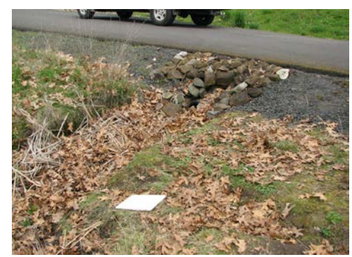
Figure 4. Landscape culvert and sloped surface on edge of roadway traveled.

Employees wore chemical-resistant coveralls, goggles, and gloves while applying pesticide. Although it could not be determined from evidence