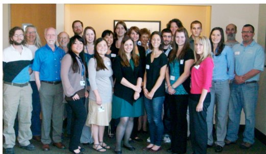
Murdock scholars, mentors and staff, June 2013

related to professional development and are required to write their findings in a thesis and present their findings at a statewide meeting. We are thankful to the M.J. Murdock Charitable Trust for investing in this valuable program.