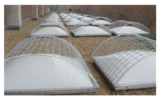
Passive fall protection on skylights

Our safety talk today is about a 19-year-old who died after falling through a skylight. He was helping his self-employed father repair the roof of a warehouse. The roof had about a dozen skylights and a 5-foot parapet wall around the edges. His father was contracted to repair the roof, and had assessed the hazard risk noting that the skylights were a remote hazard. The victim was walking backwards to roll up a torch hose when he either tripped or stepped through the skylight. He fell 35 feet to the ground below and died of severe head trauma.