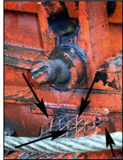
Tower hinge and box beam (arrows) broke, allowing tower to come down.

The crew was sending in a turn of four tree-length logs when the incident occurred, according to the OR-OSHA report. The report states that the logs hung up on a stump in the road line, which put stress on the yarder tower. The back-right guyline came off of its stump, which increased pressure on the next stump to its left, and that guyline came off of its stump as well. With two guylines down, the other two guylines could not hold the tower in its upright position.