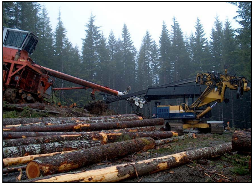
When guyline support failed, the yarder tower fell onto a nearby delimeter (right).

On April 18, 2003, a 42-year-old logger, working as a chaser , was killed while standing on the landing site during a cable yarding operation. A Madill 071 yarder was in the process of completing a turn when the tower collapsed. The tower fell on the boom of a delimber that was also operating on the landing site. The force of the impact caused a sheave (cable pulley guide) to shear off from the side of the delimeter's boom. The falling sheave struck the chaser on the head, and punched through his hard hat. Life Flight was summoned. The victim was pronounced dead at the scene shortly after emergency help arrived.