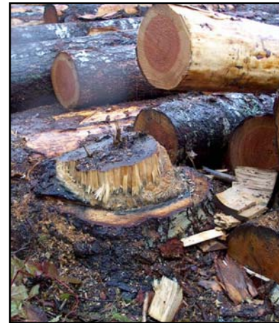
Anchor stump #1. The cable pulled over the top of the stump. Note proximity of log deck to stump (see Recommendation #1).