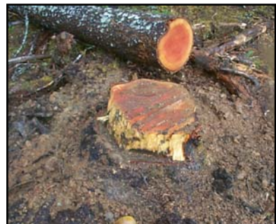
Anchor stump #2. Fresh dirt indicates the stump pulled out of the ground and released its guyline.