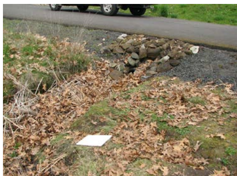
Figure 4. Landscape culvert and sloped surface on edge of roadway traveled.

Employees wore chemical-resistant coveralls, goggles, and gloves while applying pesticide. Although it could not be determined from evidence