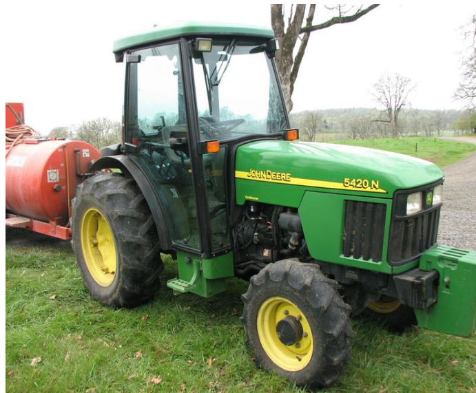
Figure 1. Tractor and trailer mounted 400 gallon chemical tank.

It was the end of the day, workers were returning to the equipment shop after applying pesticide in the vineyard. On the crew was a 41-year old worker who had worked for the employer for five years. Witnesses reported that he was standing on a make-shift wooden platform that had been attached to a trailer mounted 400 gallon chemical tank containing pesticide. The make-shift wooden platforms were created and installed by the employer. The trailer was in tow by a tractor. The worker's baseball cap blew off while he was riding on the platform on the moving trailer. He stepped off the platform to retrieve his cap. Once back on the platform, or as he was stepping onto the platform, the worker lost his balance and fell to the ground. He sustained a fatal head injury in the fall when his head struck a large rock.