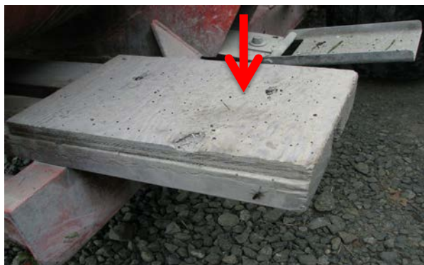
Figure 2. Close-up of wooden platform constructed by employer.

The worker was standing on the make-shift platform on the moving trailer when his baseball cap flew off. He stepped off the platform to retrieve his cap. Once retrieved, it is not known whether he stepped onto the platform and then lost his footing, or if he fell while attempting to step onto the platform. In the fall he struck his head on a large rock on the edge of the roadway and lost consciousness. The crew foreman called the vineyard manager who called