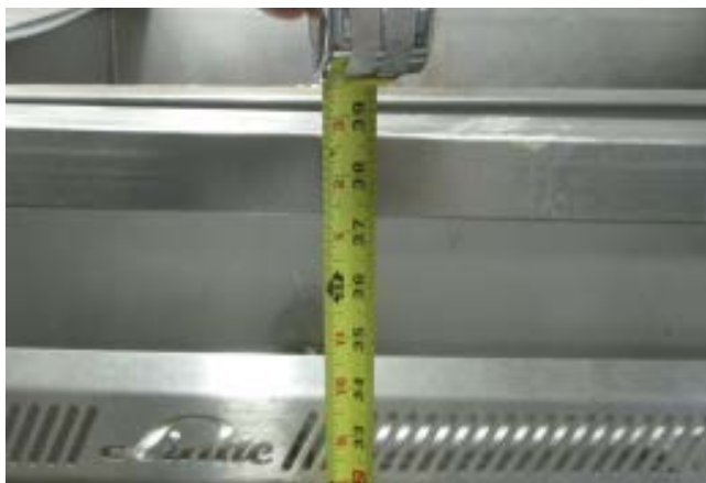
Figure 3. Top rail height on platform. It's not known how the victim entered the vat, but evidence suggests that he fell over the railing.