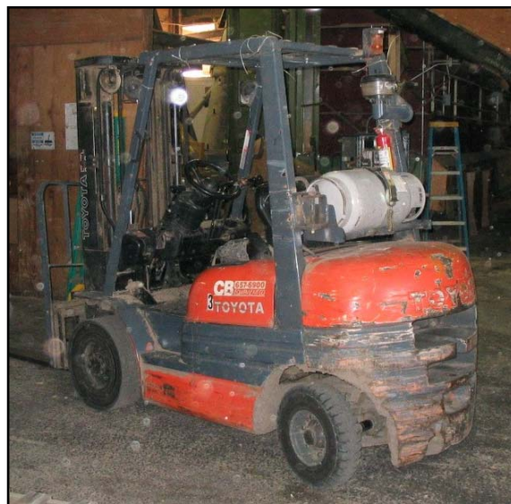
Twin of forklift that backed into and crushed the operator after he jumped out to help load a truck.

On February 10, 2004, a 42-year-old forklift operator was crushed between the forklift he had been operating and a semi-trailer he was helping to load. Assisting the truck driver to tie down the load, the operator backed the forklift to the opposite side of the trailer, put the automatic transmission into neutral, engaged the parking brake, and jumped out to take the strap thrown across the load by the truck driver. The forklift's engine was left running. While the operator was facing the trailer and busy with the strap, the forklift engaged in reverse and backed into him, crushing him against the trailer with enough force to make the trailer shudder. The truck driver looked under the trailer and saw the victim's legs dangling in the air. He ran to engage the gearshift on the forklift into forward to release the victim. Efforts to revive the victim were unsuccessful, and he was pronounced dead at the scene.