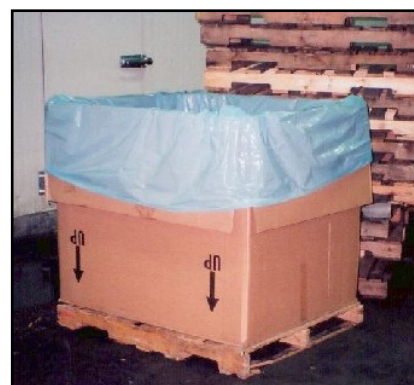
A cardboard “tote” container with plastic liner held 1,000 lbs of frozen food product.

In a cycle, the tote-dump operator waited for a forklift to deposit a pallet with a loaded tote onto the tote dump’s metal cradle, then raised the cradle to empty the tote into the