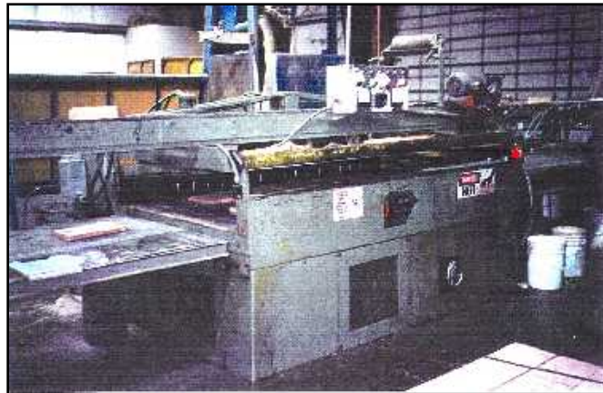
The glue press operates on an automatic cycle, with a conveyor running beneath a glue roller and into the press.

On March 17, 2005, a 61-year-old woodworker operating a glue-press machine at a wood-products firm was killed while attempting to replace a glue tray while the machine was running. The glue tray had been removed to correct a glue-dripping problem. The press operator instructed another worker to finish processing a product that was already in the press, while he and a new coworker attempted to reattach the glue tray. The press operator put his head between the frame and the closed top lid of the press in order to see where to latch the glue tray. While he was in this position, the top plate suddenly lifted at the end of a programmed automatic cycle, and crushed the operator's head against the frame. Coworkers witnessed the event and immediately extricated the operator from the machine. The victim was transported to the hospital, where he was pronounced dead.