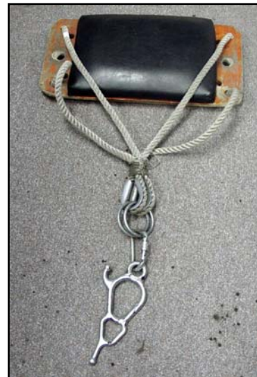
Detail of a boatswain's chair shows attachment to a descender with a screw-type carabiner.