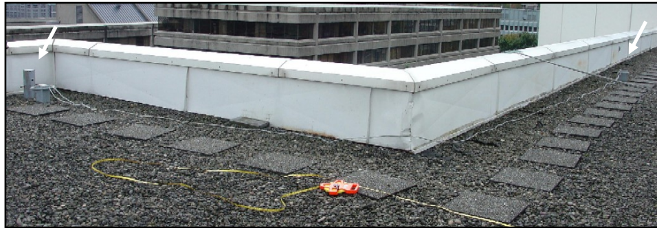
Two certified anchor points are visible here on the roof of the building where the incident occurred. The victim's anchor line was not attached to the left anchor.

On October 19, 2005, a 31-year-old Hispanic window cleaner was killed when he fell six stories from a balcony on a seven-story commercial building. The