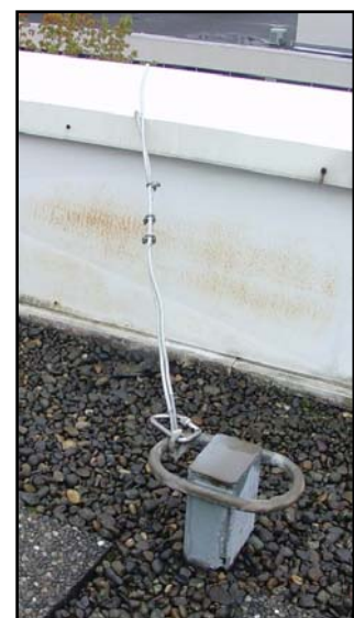
The one secured anchor line dangled over the roof edge following the incident.

The coworker set up his own anchor cables to roof anchors farther down the roof line, and rigged his own lines. Both cleaners put pieces