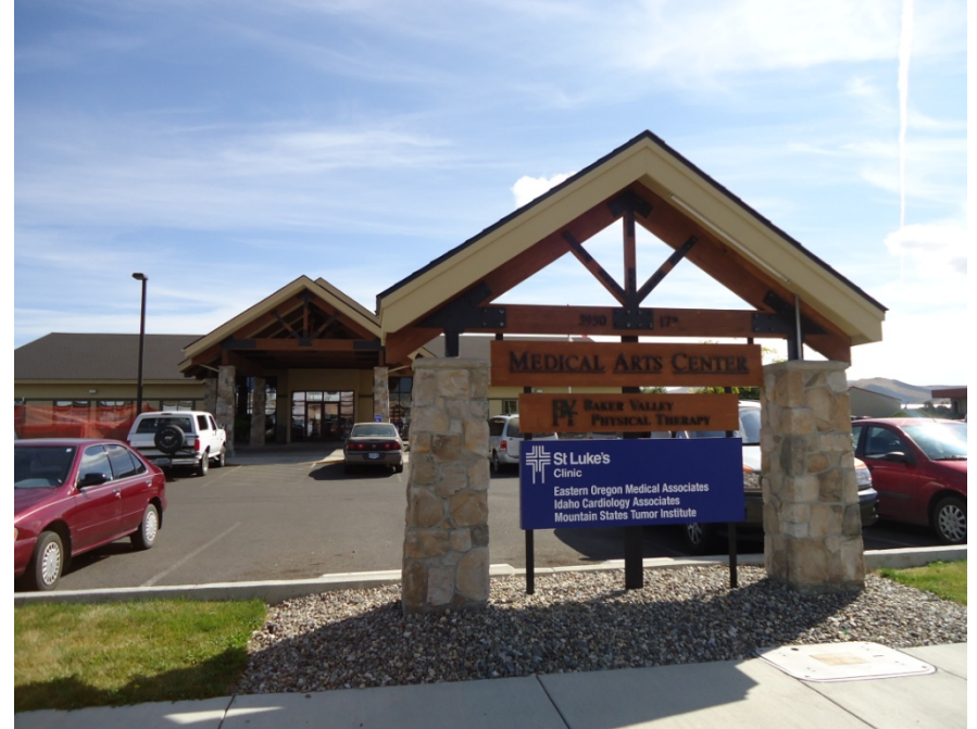
St. Luke's Eastern Oregon Medical Associates