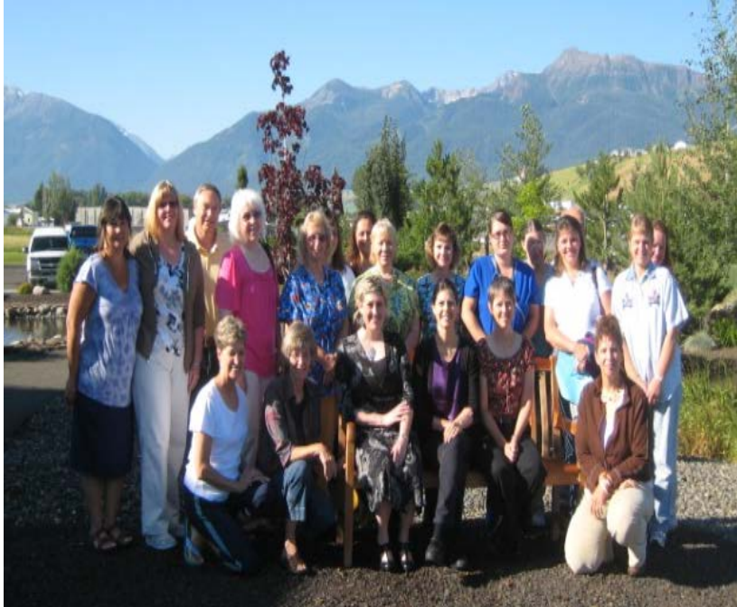
Winding Waters Clinic