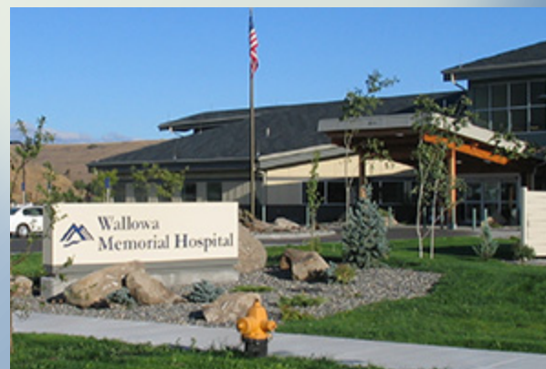
Wallowa Memorial Hospital; Enterprise, OR

USDA is an equal opportunity provider, employer and lender.