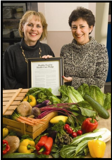
Healthy Food Pledge