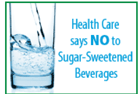
Healthy Beverage Initiative