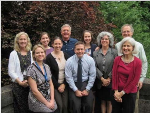
Preventive Medicine residents, faculty, and staff