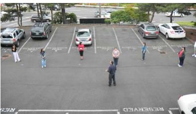
Measuring Quality Improvement course: Students learning statistics

In partnership with our CDC-funded Prevention Research Center—the Center for Healthy Communities—the Northwest Portland Area Indian Health Board put on another successful Summer Institute! The 2011 Summer Institute hosted 80 American Indian/Alaska Native health professionals who participated in this three-week long research training. Course evaluations and feedback from students suggest that we have had another successful year.