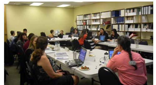
Grant Writing/Proposal Development: Students break out in small groups to discuss their proposal