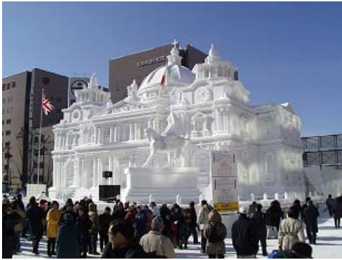
Sapporo Snow Festival