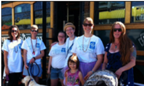
Richmond staff teamed up with the My Street Trolley for the Division/Clinton Street Fair Parade on July 26.