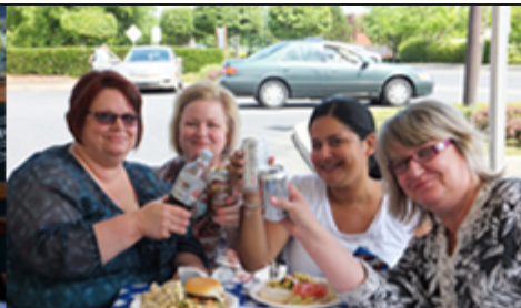
Scappoose celebrated the hard work of faculty & staff at its annual summer BBQ on July 11