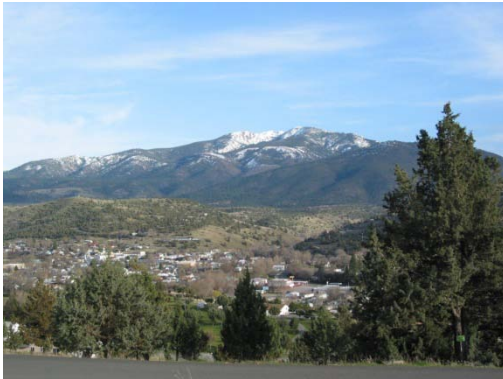
John Day, Oregon