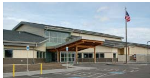
Wallowa Memorial Hospital