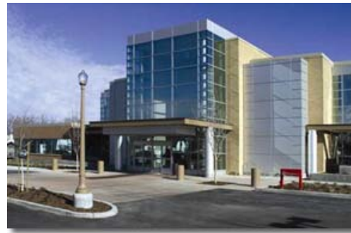
Holy Rosary Medical Center