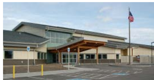
Wallowa Memorial Hospital