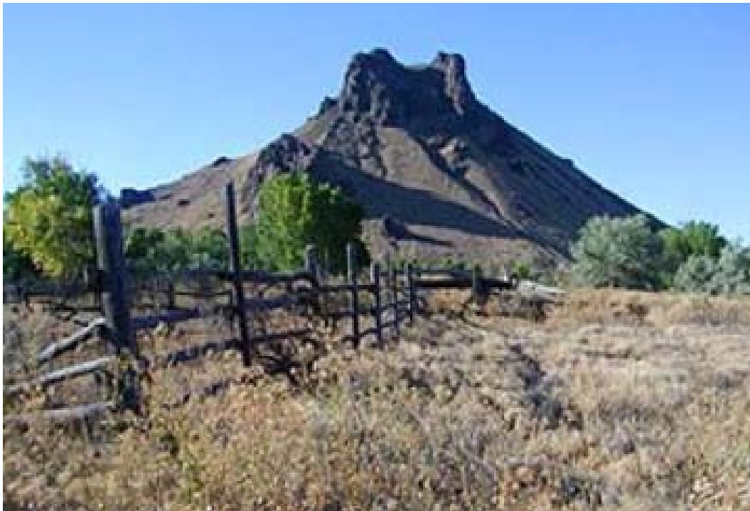
Malheur Butte, Oregon

Second year residents spend two months in one of two small communities, Enterprise or John Day, in northeastern Oregon working in practices with family physicians and experiencing rural family medicine first-hand.