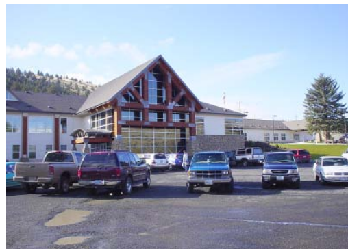
Blue Mountain Hospital