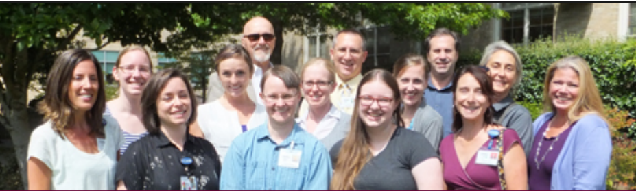
Family Medicine at Richmond staff turned out to support the clinic's four President's Award nominees at the President's Award Ceremony on August 20 in the Rose Garden.