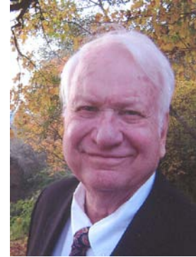
Senator Walter Brown