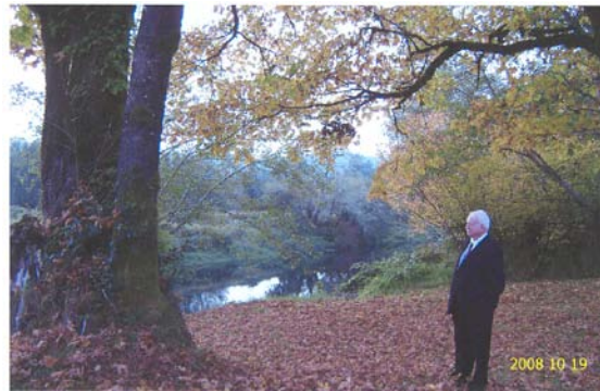
Barbara S. and Walter F. Brown Memorial Park