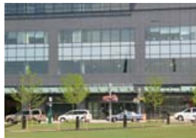
Center for Health and Healing

Kirk Auditorium, 3 rd Floor South Waterfront Campus