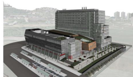
This is a sketch of the Collaborative Life Sciences Building as it faces the river (with the viewer looking west). Light rail tracks are to the left of the building in this drawing.

"We are doing the best we can and I'm sure good things will come out of this that will bring new opportunities for collaboration and learning.