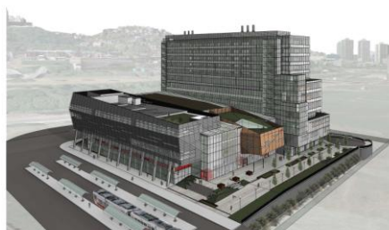
This is a sketch of the Collaborative Life Sciences Building as it faces the river (with the viewer looking west). Light rail tracks are to the left of the building in this drawing.

"We are doing the best we can and I'm sure good things will come out of this that will bring new opportunities for collaboration and learning.