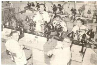
Third floor "simulation clinic," 1957 Impressions.