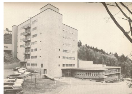
Surface parking was plentiful in 1959. There are cars parked to the right of the rotunda in this old Impressions photograph.