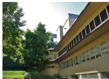
The School's 1956 building received a small shot in the arm facilities-wise in preparation for the recent Commission on Dental Accreditation visit.

In early October, the 15-person team conducted three days of on-campus interviews, observations, and discussions. A final report is expected by the end of the year. "Our preliminary report is that we did very well," said (continued at right)