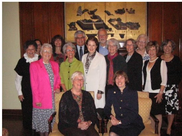
The Advisory Council share information, host events, and secure funding for the programs of the Center for Ethics in Health Care