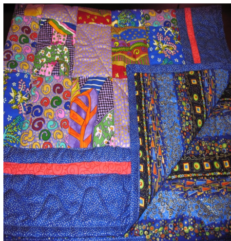
Each handmade quilt is unique with the goal of bringing comfort to a dying patient and their family