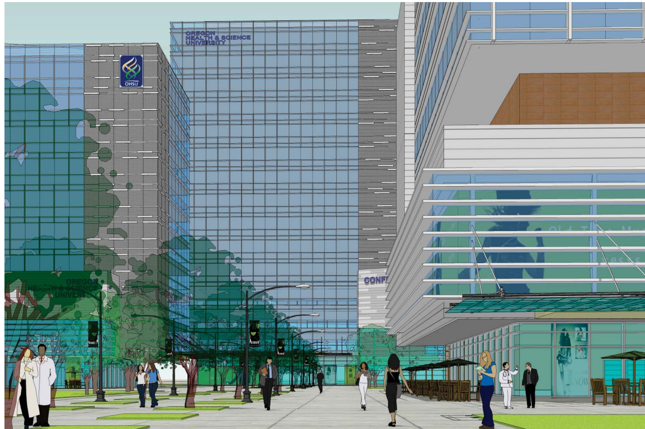
⑤ Promenade looking North