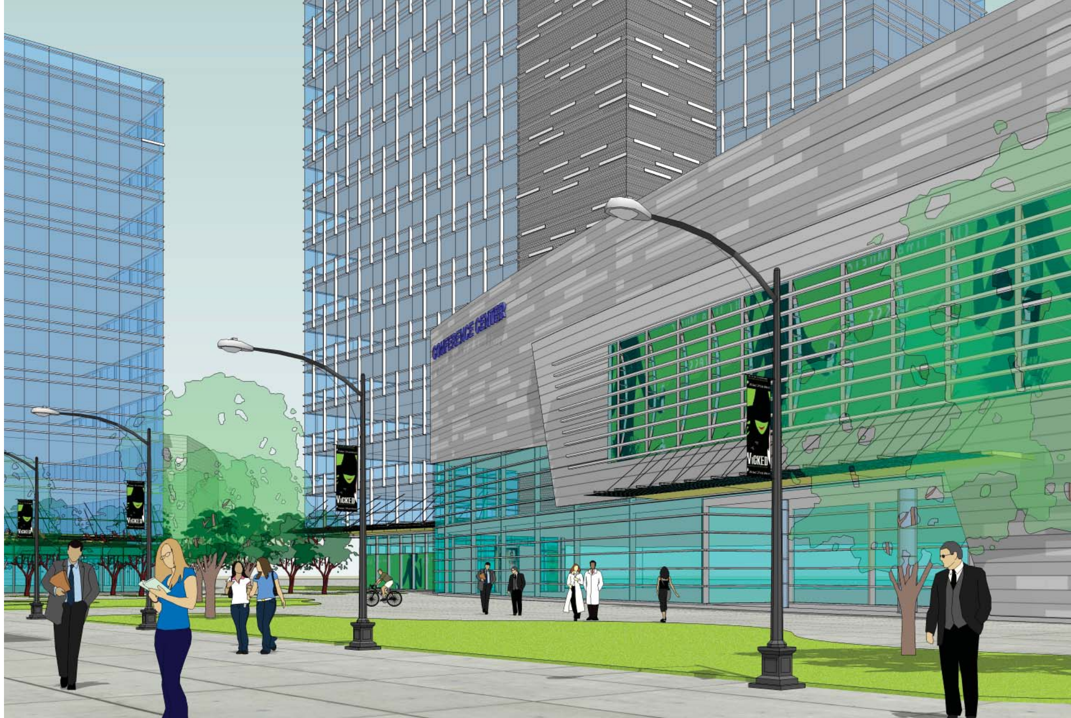
④ Conference Center Green looking Northwest