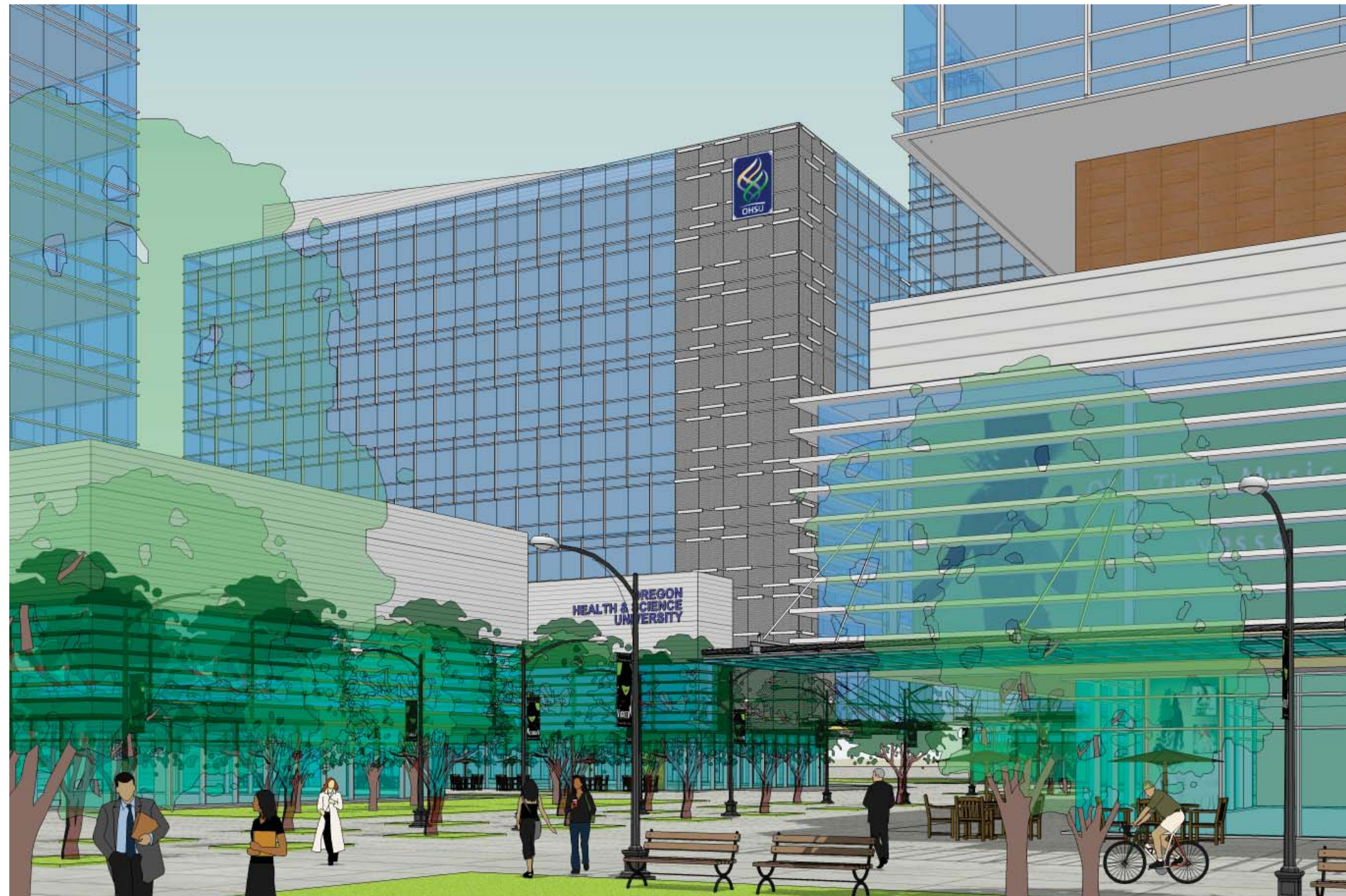
③ Campus Green looking Northwest towards Promenade