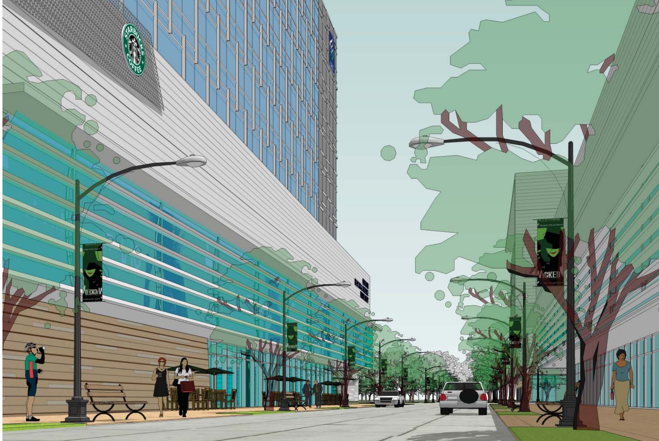
⑥ Baker Street looking towards River