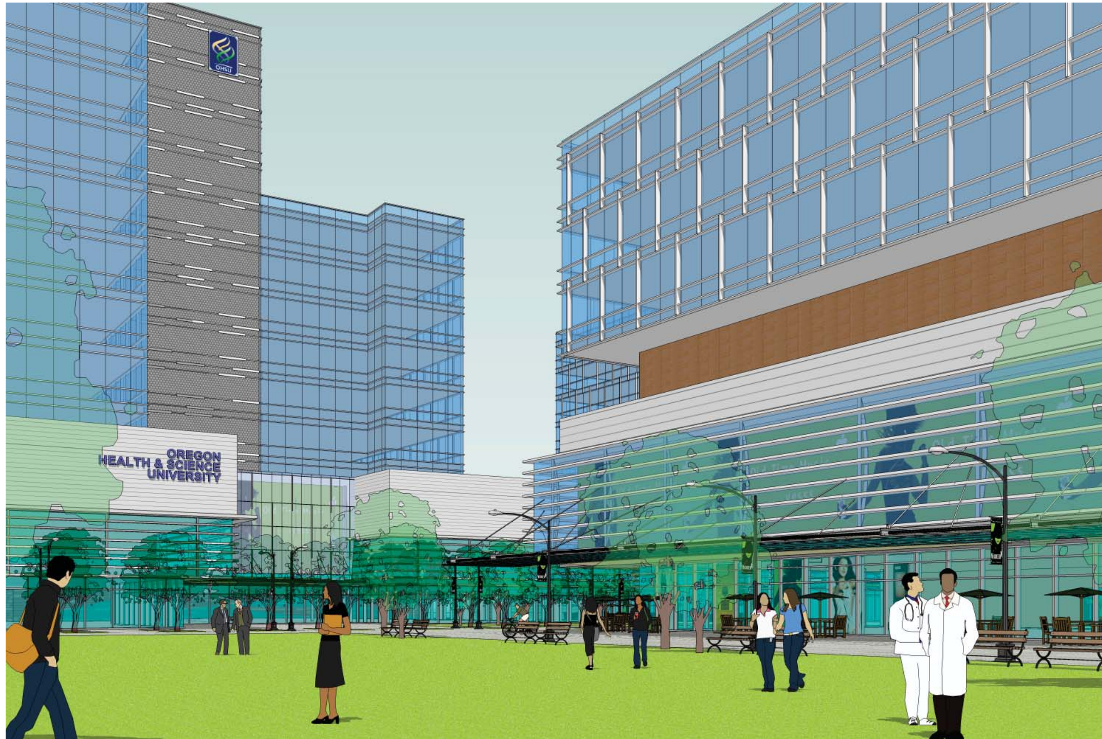
② Campus Green looking West