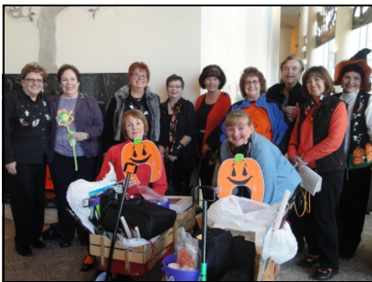
Felicity Chapter Members