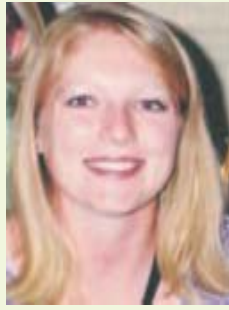
La Grande campus

The La Grande campus student senate is made up of four juniors and four seniors. Our goals for the remaining two terms include activities that range from t-shirt sales to NSNA convention plans.