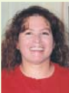
Klamath Falls campus