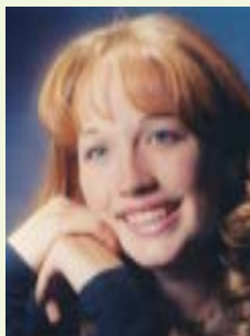
Klamath Falls campus