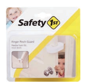
Finger pinch guard