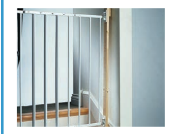
Universal gate installation kit