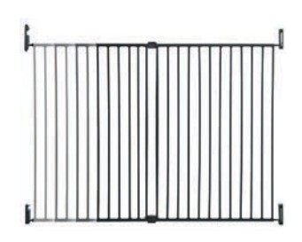
Broadway xtra-wide gro-gate hardware mounted (safe for stairs)