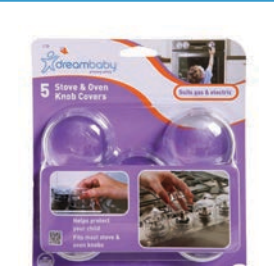
Stove knob covers