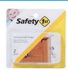
Furniture wall straps