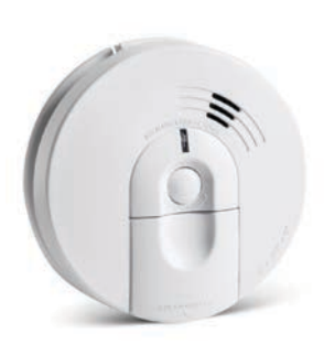
Smoke detector $20