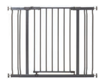
Ava pressure-mounted gate