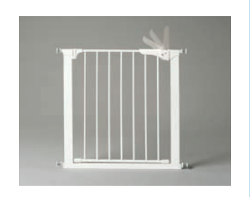
Gateway pressuremounted gate