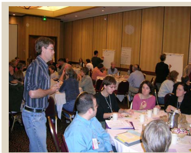
A breakout session at the 2004 Convocation

Summary: This study redesigns well-child care by systematically screening children ages zero to six years old within the primary care setting for early risks of behavioral health disorders. The study is also designed to integrate the medical and mental health settings to provide coordinated referral and follow-up services. (continued on page 5)